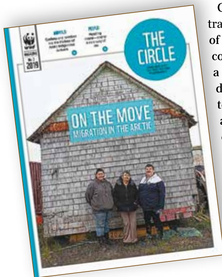
The Circle , October 2019.

But the news is not all rosy. The coastal erosion that forced Port Heiden to begin relocating three decades ago continues. Goldfish Lake—separated just last summer from the advancing ocean by a crumbling road to the community’s former location—has since drained and disappeared.