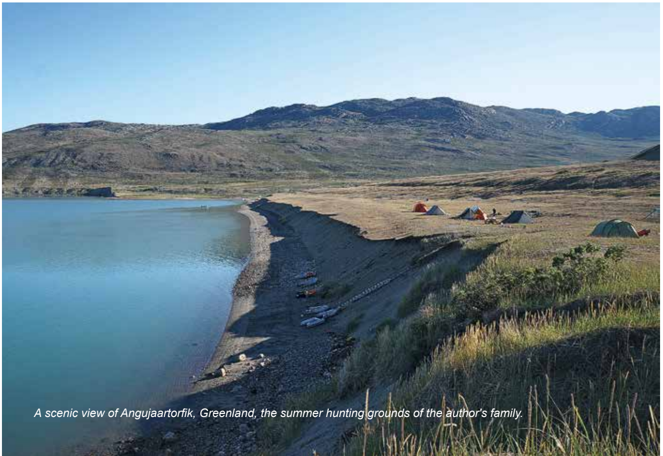
A scenic view of Angujaartorfik, Greenland, the summer hunting grounds of the author's family.